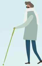
Accessibility and Social Inclusion